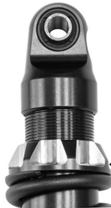
Spring Preload Adjustment Ring

FOX Street Performance Series IFP and IFP R shocks are equipped with spring preload adjusters.