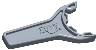
Preload Adjuster Wrench